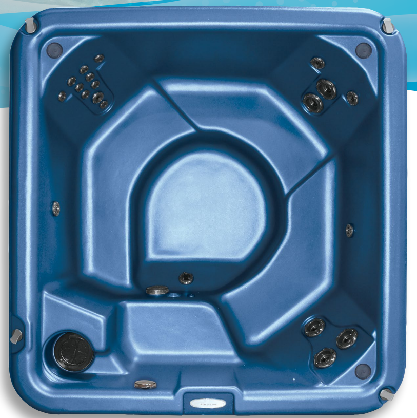
80" W x 82" L x 35" H