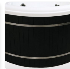
Stainless Steel Banding (only available on round models)